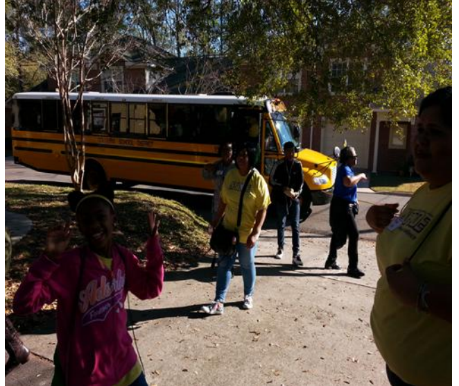
The I-10 Connection 2017 comes to a close after lunch and presentations at the Florida A & M University School of Business and Industry (SBI)