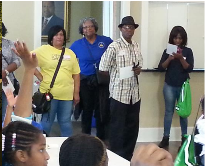
Out of town achievers travelled by bus. It was a beautiful sunny and enriching day for all.